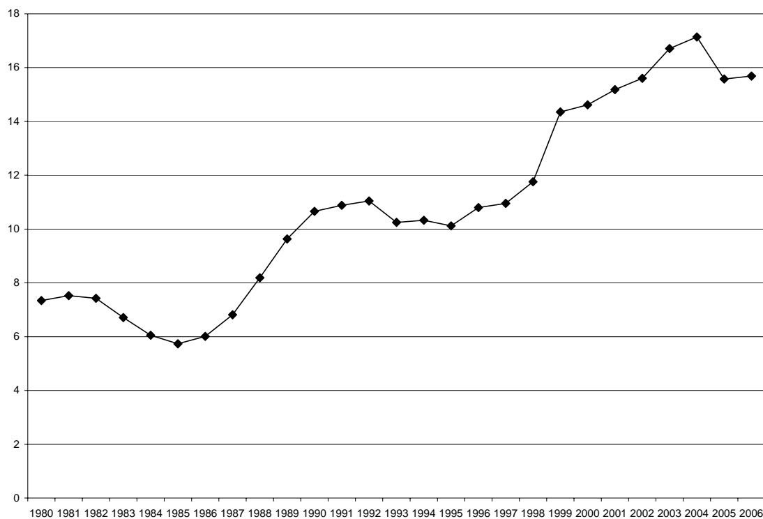
Figure 1. WPs as a share of the total publications in EconLit. Percentages are shown as moving averages of three years.

Figure 1 shows an increase in the relative size of WPs. Their percentage of the publications in EconLit has increased from about 7 percent in 1980 to about 16 percent in 2006. This study analyses data in the ten-year period from 1996 to 2005 and in this period the share of working papers is increasing from about 10 percent to 16 percent.