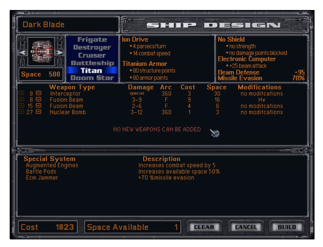
Figure 5: Ship design screen showing the different areas where alterations can be made.

depending on its basic nature. The special features of the ship may also add something to the weapons like double shot one turn and no shot next turn or better targeting. By the end of the game the player has to choose between approximately twenty weapon technologies (not counting with the different added specializations) and about twenty special features as well, so as this shows there are thousands of different designs to end up with, which make this object highly inventible.