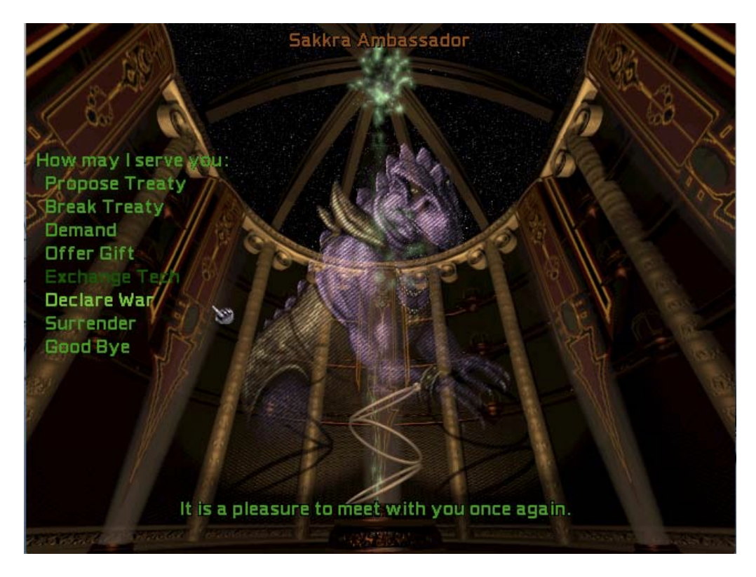
Figure 11: normal dialogue.

If no deals are struck with an alien race the diplomatic connection with it will slowly degenerate, whereas the opposite is the case if treaties are made with them. Some races have the race specialty that they are repulsive (something a human player often chooses to be when playing against other humans, since it mainly affects the relationship with AI-controlled races and is worth -5 points in the race creation phase). When a race is repulsive it can only interact with other races in declaring war, suing for peace or surrendering, thus repulsive races often grows closer to an aggressive diplomatic stance before other races which results in them being the first of the AI-controlled races to be attacked by human players, since they cannot generate money through treaties or systems through demands.