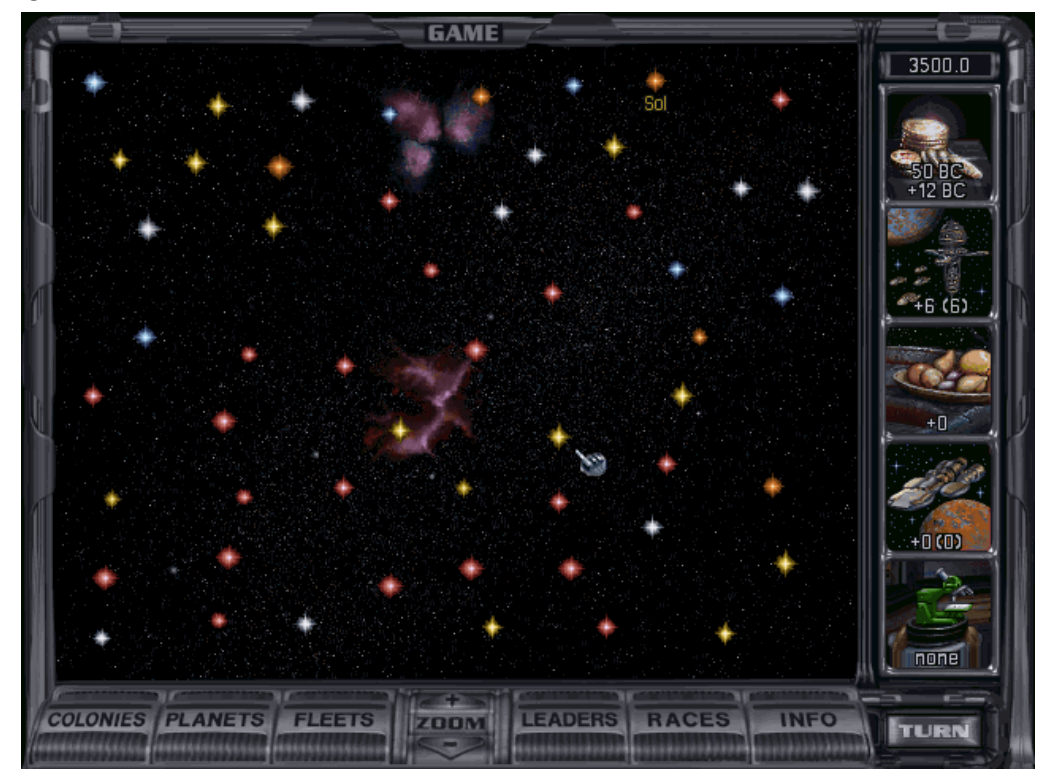
Figure 1: Map of the known universe, turn 1.

high quality of gameplay that the player quoted above so enjoys, thus placing MOOII in the group of emergence games.