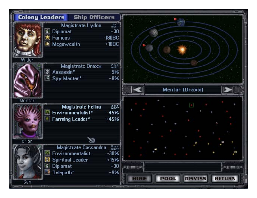
Figure 15: Colony leaders and ship officers may be assigned to star systems and fleets, respectively.