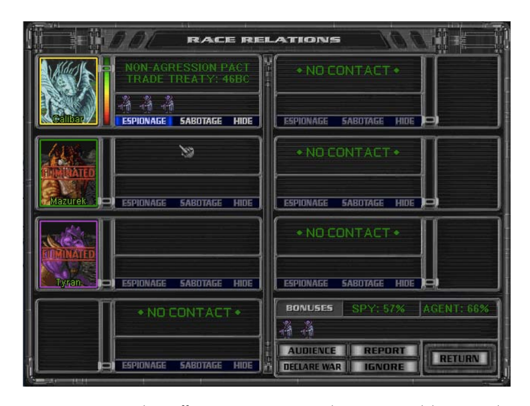
Figure 14: spies in race screen. Three offensive spies are sent to do espionage, while two are doing counterespionage.