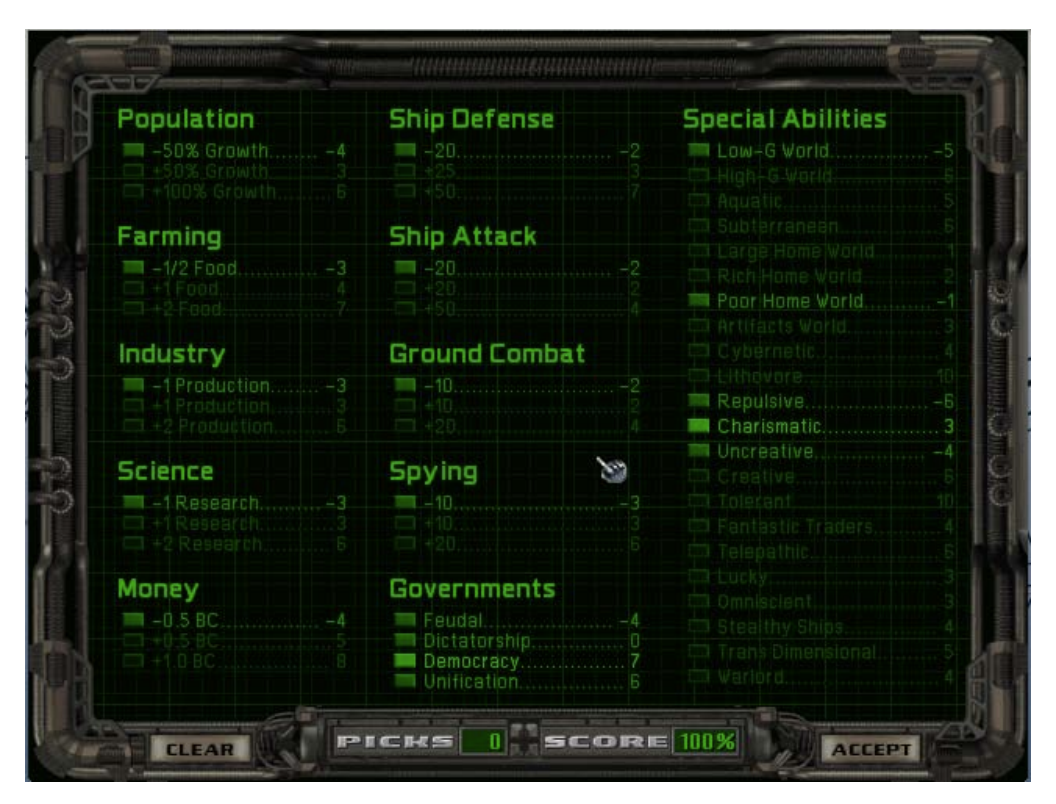
Figure 7: Race creation screen as it looks for the Human race. They have chosen Democracy and Charismatic (highlighted), which adds up to 10 points, so no negative traits were needed in this race design.

there are many or few of them, if the Antarans attack or not, in what historical time the game begin and more. And when it comes to race choices there are 13 predefined races to choose from, and the opportunity to create a custom made race defined by choices made between 10 different defining characteristics<sup>7</sup> and 22 special abilities<sup>8</sup>. The player has the choice of spending up to 10 points in creating his race, and the price of each choice ranges from 1-10 points. It is, however, possible to decide to make picks that counts as negative to the race, like choosing a poor home-world, lower birthrates and so on, in order to gain more points for positive traits. The player can make negative choices to a total sum of minus 10 points, making the total sum for positive picks 20 points. It is evident that the possibility to play the game using so many different combinations will be cause for great variation from game to game, and even if the same world and race is played again, there are still new starting positions and the opposing races to take into the equation and the second game might well be a completely different experience from the first.