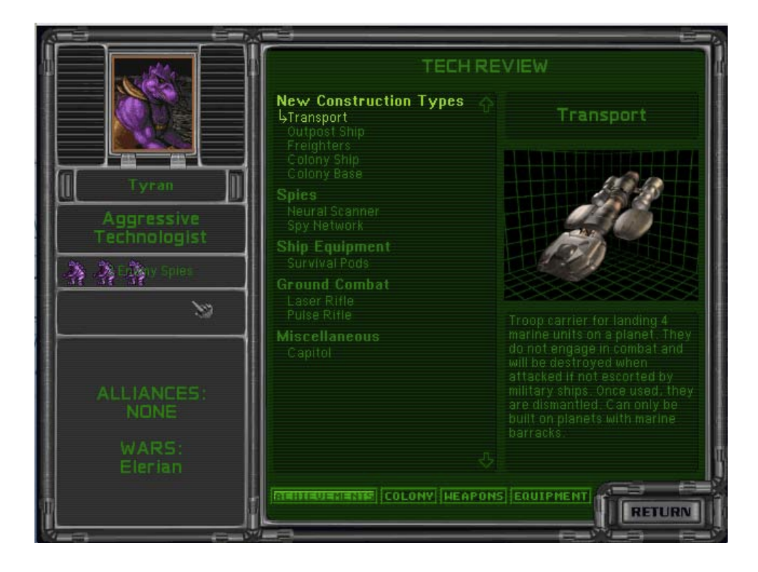
Figure 10: The race report screen shows that Tyran has three enemy spies and is at war with the Elerians.