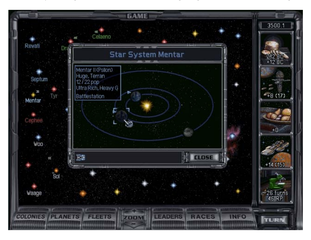
Figure 3: A star system with two colonized planets, the details of one is highlighted in the blue box. In the background can be seen the galaxy with a few different races present.

Once a planet is colonized the main interaction with the planet happens through manipulating the population, symbolized as small humanoid characters (one character signifying a million citizens) ( Figure 4 ). There are three different boxes to put the citizens in: farmers, workers and scientists. How they are placed decides what field of expertise the colony is going to have. Many farmers create a surplus of food to help the starving populations of barren, radiated and toxic colonies; many workers create high production, which can be used for building ships and colony structures, for booming the population through building housing projects or the economy through building trade goods. And scientists naturally generate research, which is crucial to keep the edge on the enemies and building a high score at the end of the game.