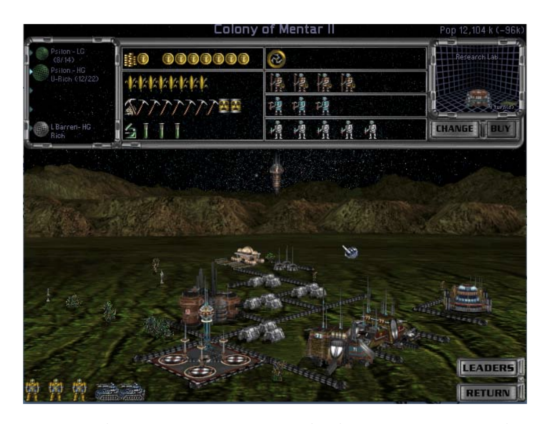
Figure 4: A colony view fairly early in the game. There are four farmers, three workers and five scientists, later in the game these ratios will change, as the right technologies are researched.

The quote in the chapter above also points at the balance of the difficulty level of the gameplay touching on notions of flow theory. To the player quoted it is obviously important for the level of replayability that the game has the right difficulty level. He wants to be enabled to play in a way that is challenging to him. He does, however, not want to play in a way where he is forced to play by a fixed formula to win, since a fixed formula takes most of the creativity out of a game. To him some of the challenge of MOOII comes from developing the colonies for example through making them into industrial or research colonies through building the pre-requisite buildings. Another player who mentions developing the colonies as a major reason for playing the game takes a somewhat different angle to the issue of being forced to play in a certain way: