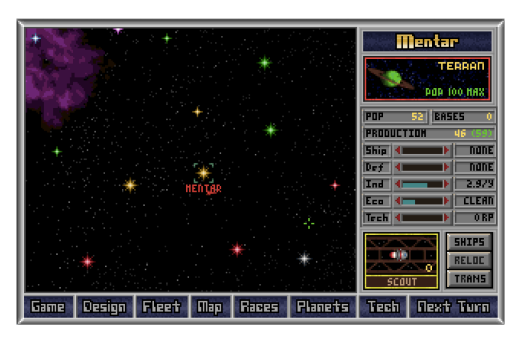
Figure 6: MOO main interface screen

The complexity of the sequel probably put some people off playing it, but fans of the first game and fans of strategy games in general seemed to like it. As the player quoted in the beginning of this chapter is saying the strategy is what he plays the game for, but because the interface is good, it does not get in the way of the pleasure of playing the game. He mentions the colony screen as something he misses in other games, which seems to imply that he likes the elements of micromanagement in the game. He is in other words a player who likes the increased level of player control in the sequel compared to that of the first installation of the game. There is an equivalent to the colony screen in a few other strategy games most notably amongst these is the Civilization series, where you have many of the same elements to manipulate: buildings, population etc. Most likely the player quoted here has not played any of those games or did not remember them while answering the survey.