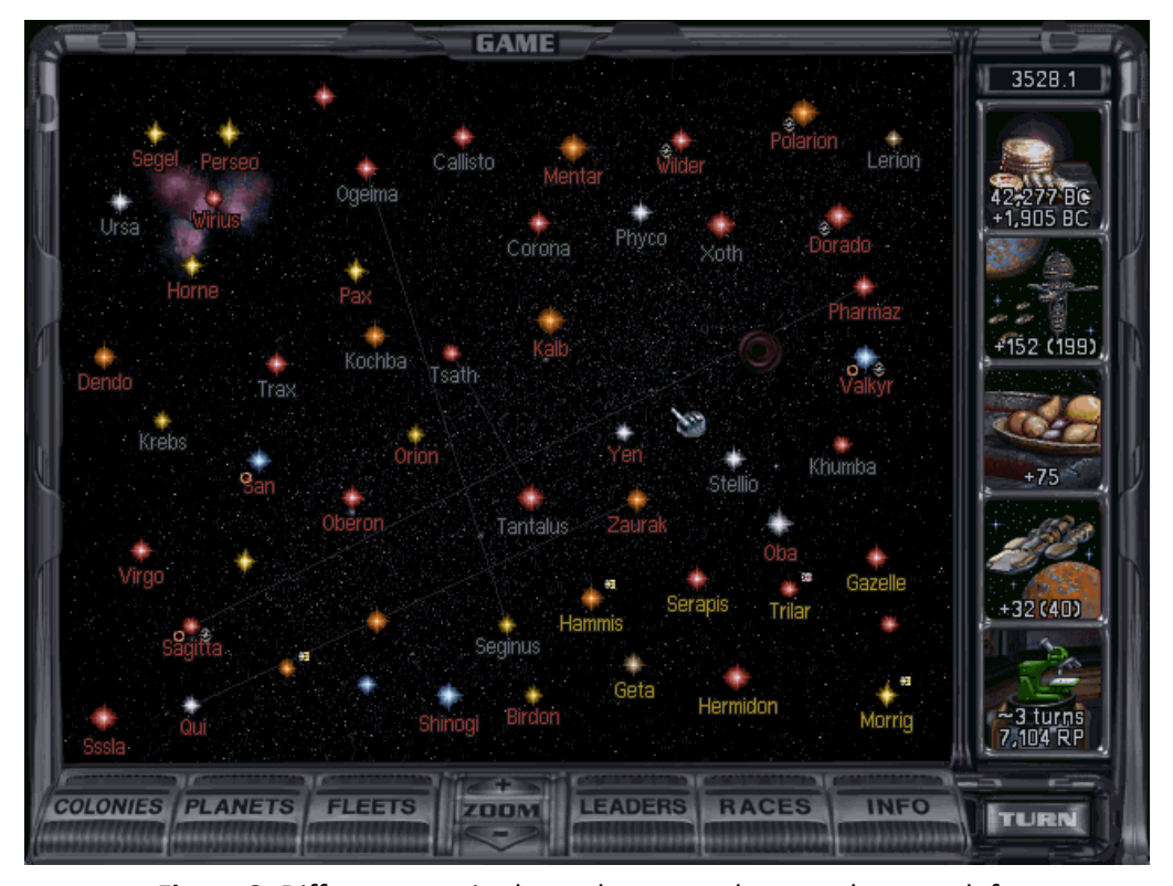
Figure 2 : Different map in the end game, only one other race left.