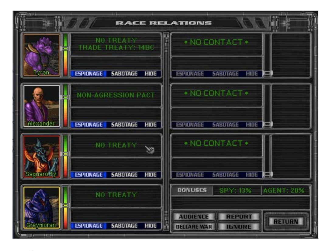
Figure 9: The different races that the player is in contact with. There is a trade treaty with Tyran and a non-aggression pact with Alexander.