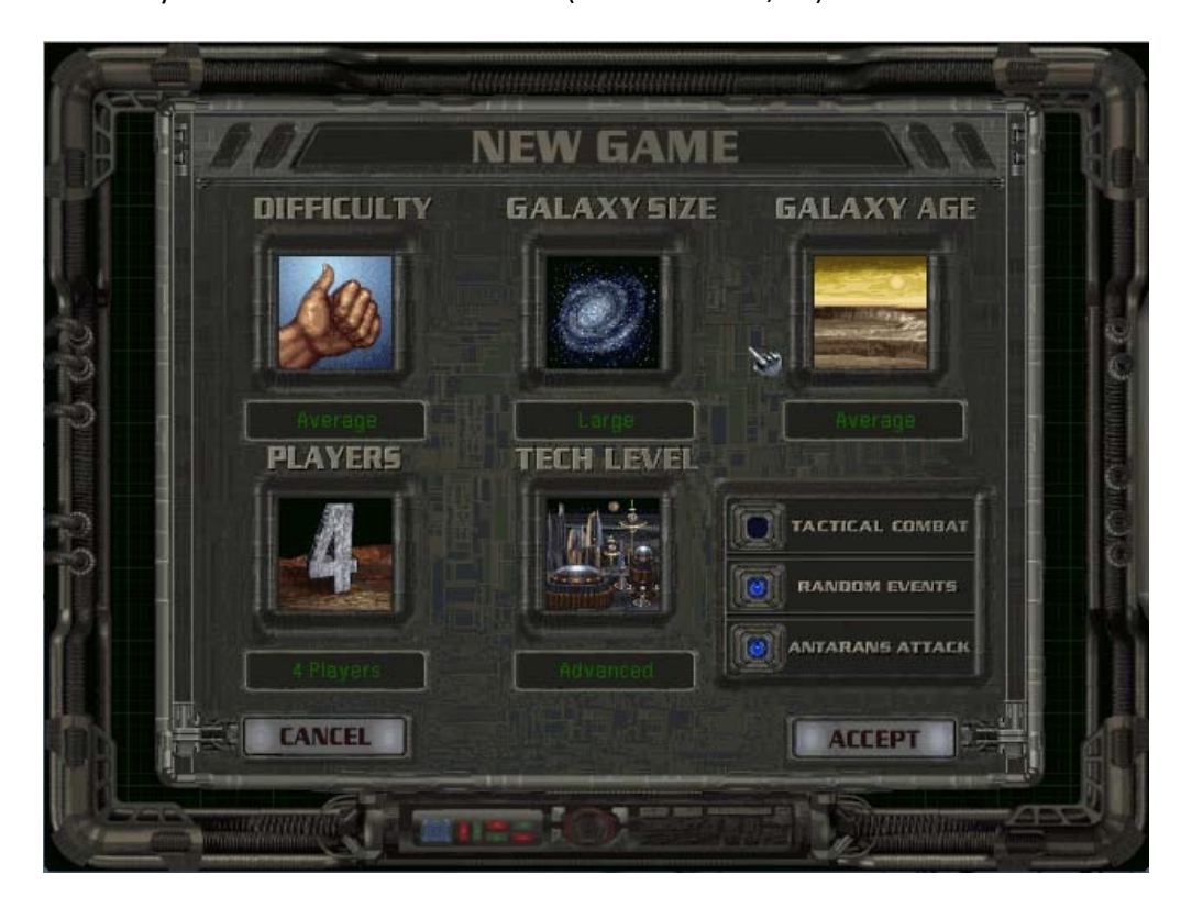
Figure 13: World creation screen

story of a narrative and therefore cannot be left out, without altering the story. Satellites are the supplementary events that can be taken out or altered without changing the story of the narrative; they make up the discourse (Aarseth 2010, 7). According to Aarseth the concepts of kernels and satellites "allow us to say something about the ways that games can contain one or several potential stories." (Aarseth 2010, 7). The term kernels and satellites was coined by Seymour Chatman in his book Story and Discourse (1986). He says that: "Kernels cannot be deleted without destroying the narrative logic." (1986, 53), and according to him satellites can be deleted without destroying the plot of a narrative although it might lessen it aesthetically. Thus it seems that Aarseth and Chatman agree on the respectable importance of kernels and satellites. Chatman, however, elaborates further on the relationship between the two, saying that satellites "necessarily imply the existence of kernels, but not vice versa." (1986, 54). Satellites are what flesh out the skeleton made up of the kernels, but kernels could exist on their own, since the "kernelskeleton theoretically allows limitless elaboration." (Chatman 1986, 54).