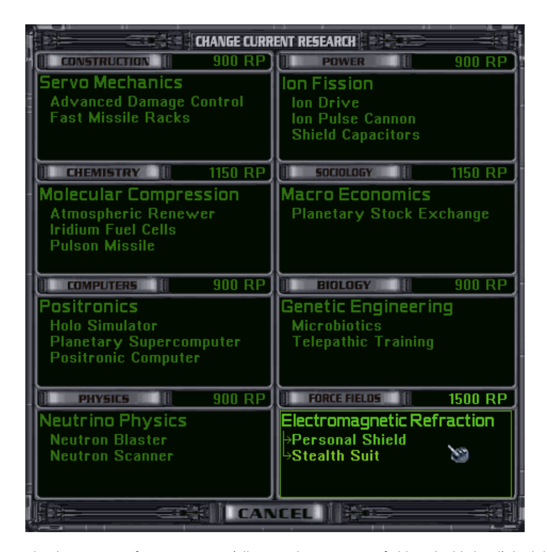
Figure 8: Technology screen of a creative race (all research areas in one field are highlighted), had this been a race with normal creativity, the player would have to choose between either Personal Shield or Stealth Suit in this field of research, now it gets both.

First and foremost, researching adds a lot of variety to MoO2 games. Different technologies mean different ship designs and general strategies. I sometimes choose an uncreative race just to be forced to adapt to different circumstances. Playing a regular race constantly faces me with important decisions: Factories or missile bases, research labs or computers, etc. (5/4/11).